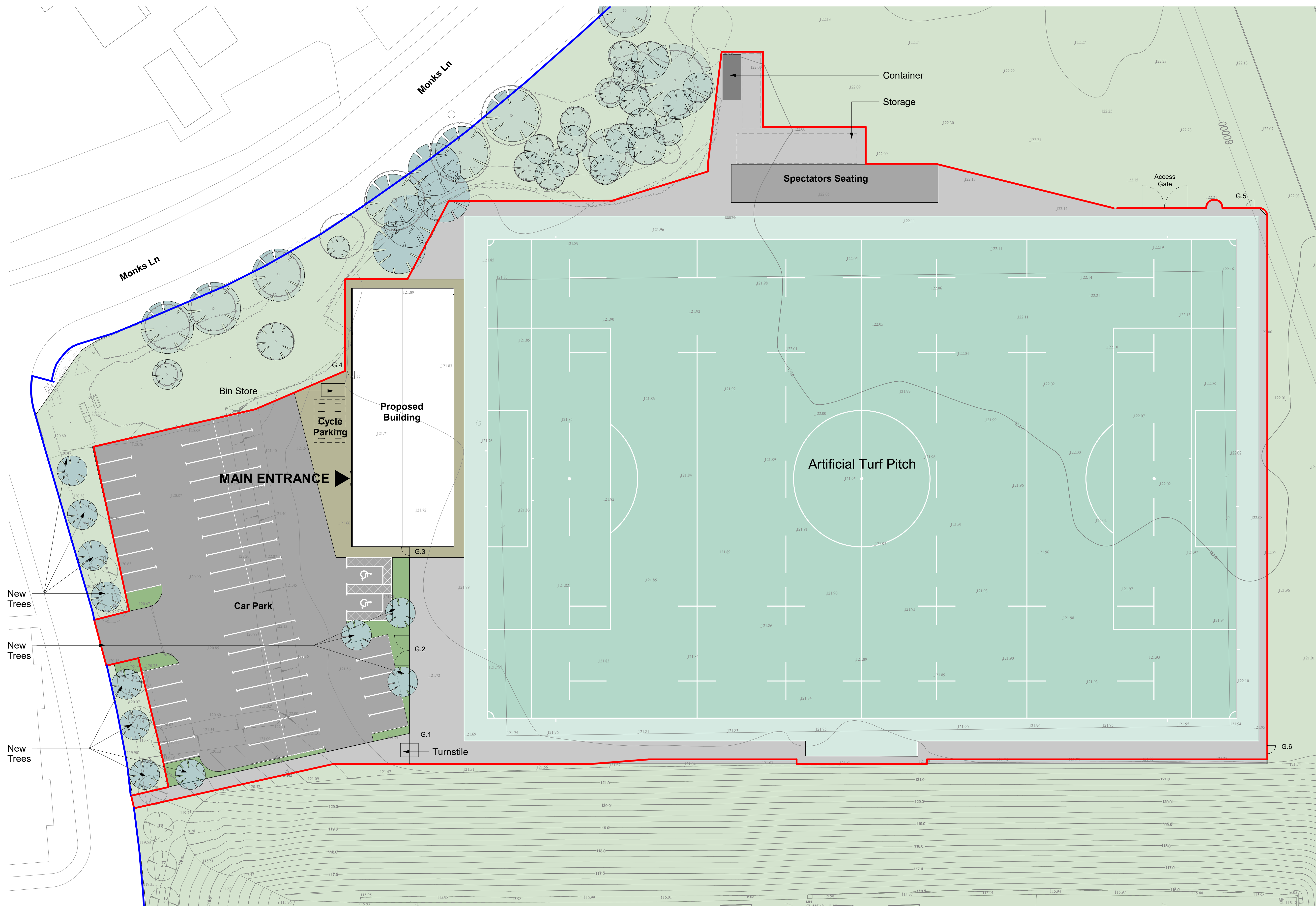
Proposed Site Plan 1 : 250

— Site Boundary — Line of Newbury Rugby Football Club's Ownership